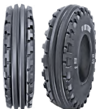
VK - 176 2 RIB