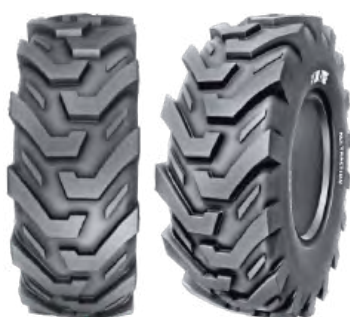
VK - 200 ALL TRACTION