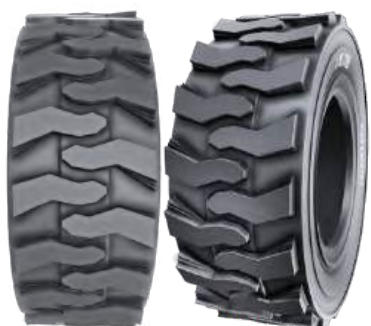
VK - 600 MUD BLASTER