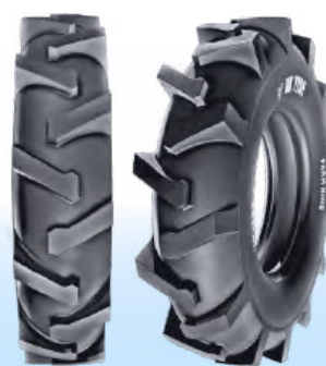
VK - 188