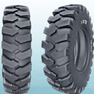
VK - 400 THE ROCK