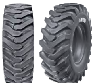
VK-222 MAX GRADER