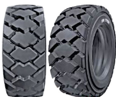
VK - 602 BULL GRIP