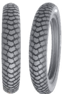
VK-707 POWER RACER