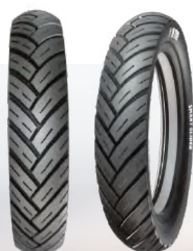
VK-705 SMART GLIDER