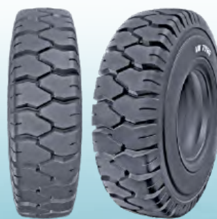
VK-605 MAXX LIFT