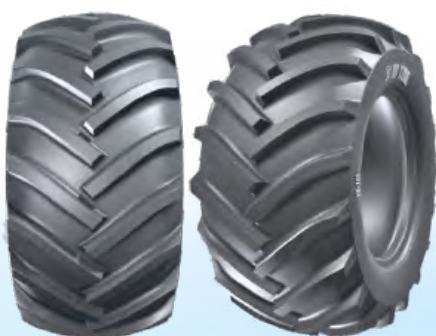
VK - 106