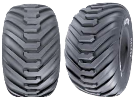
VK - 105