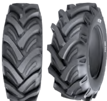
VK-111 AGRI KING