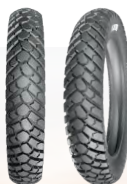
VK-706 POWER GLIDER