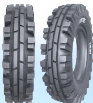
VK - 177 DABANG