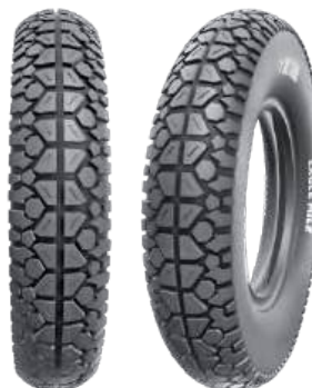
VK-710 EAGLE MILE