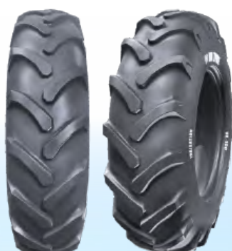
VK - 100 IRRIGATION