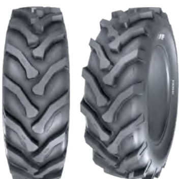
VK - 130 PRADHAN