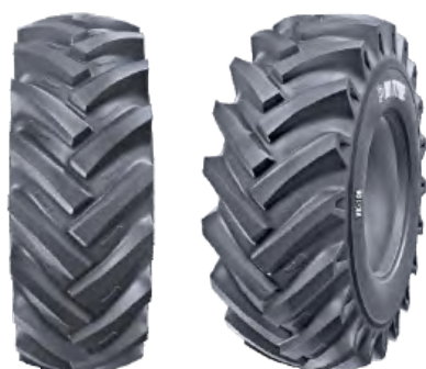
VK - 106