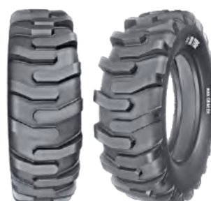
VK-223 MAX GRADER PLUS