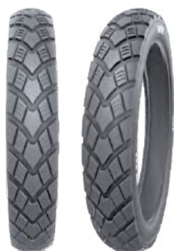
VK-715 EAGLE HAWK