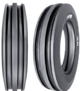
VK - 175 TRI RIB