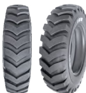
VK - 650 MUD POWER