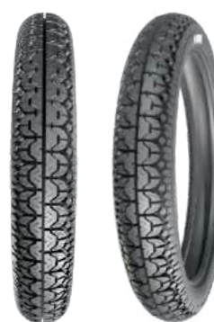
VK-704 POWER RIDER PLUS