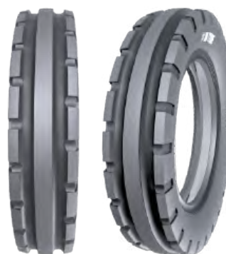
VK - 178 SARTAJ