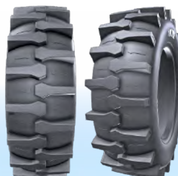
VK - 112 RAIN MASTER