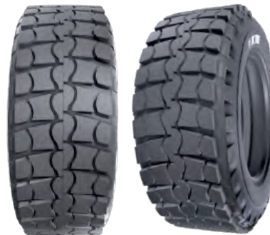
VK - 109