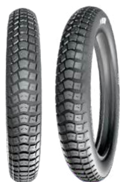
VK-703 POWER RIDER