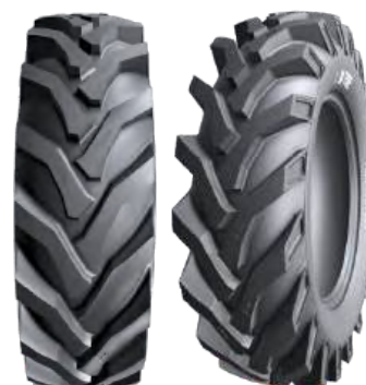
VK - 131 PRADHAN PLUS