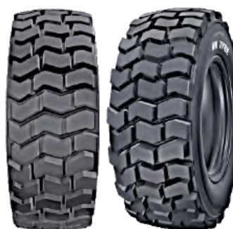
VK - 601 ROCK STONE