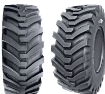
VK - 500 ULTRA GRIP