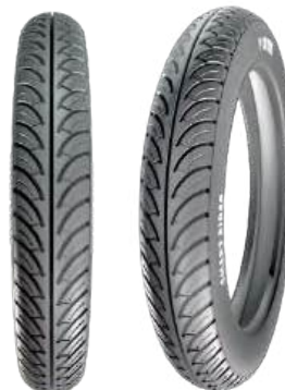
VK-702 SMART RIDER